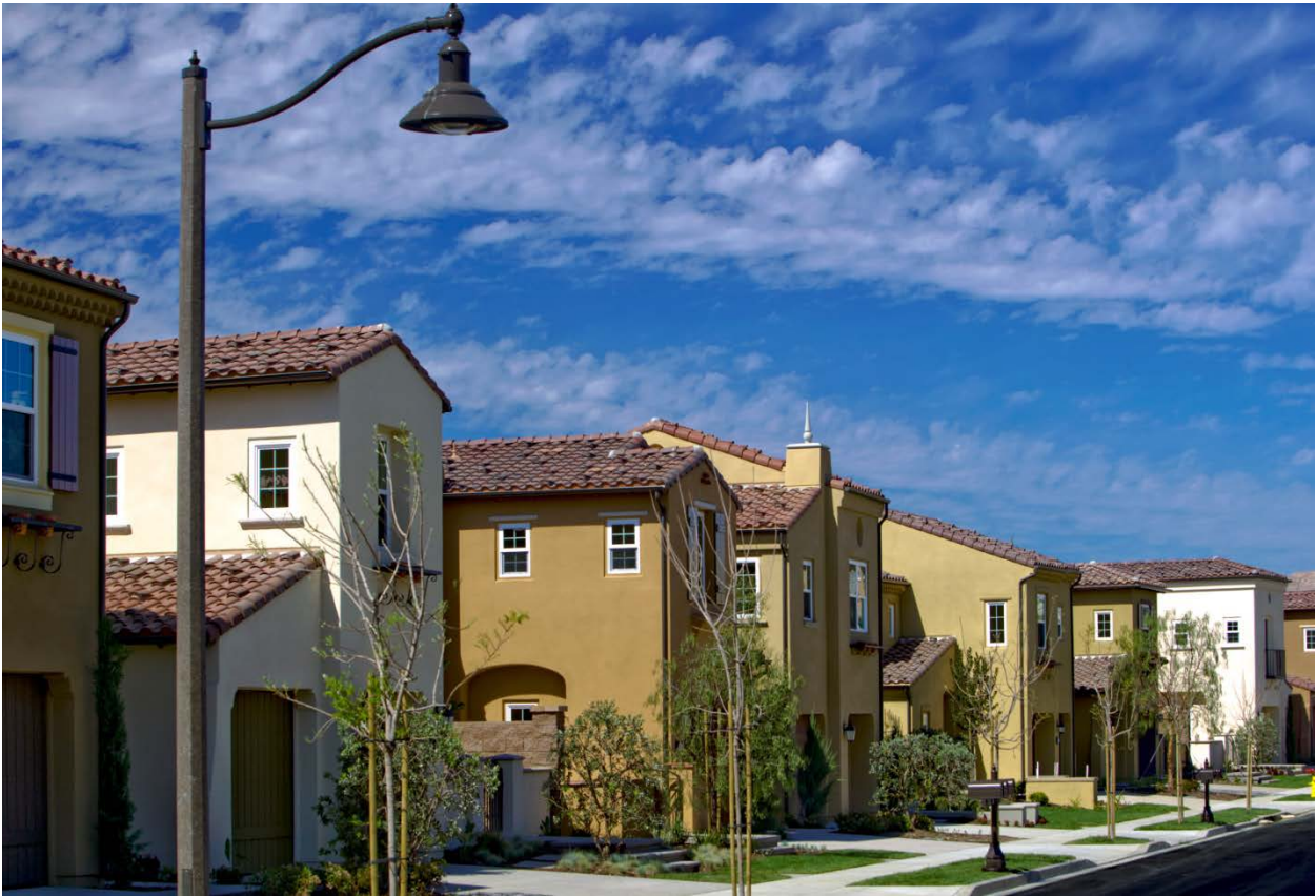
The 950 Series Homes in Area 10-2 will be similar, but not identical to the 920 Series Homes pictured here.